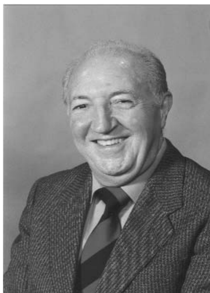
Fig. 1. Joan Oró (1923-2004).

only one carbon. By mid-1955, Oró had finished the experimental part of his doctoral thesis and thought that he would be ready to defend it in a few months. The Dean of Baylor School of Medicine recommended, however, that he waited until 1956; otherwise people might have the impression that doctorates could be obtained quickly at that school. While completing his thesis, Oró taught as an instructor in the